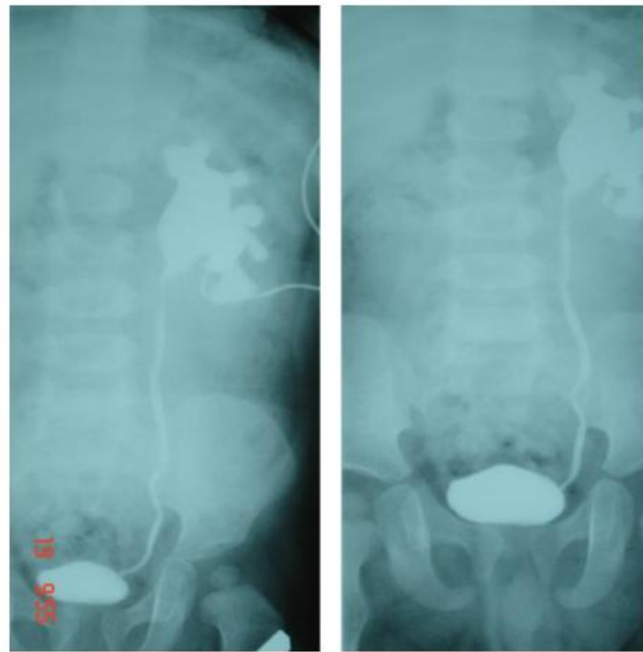
Figure 2. Contrast Study 12 Days Postoperatively Showing a Funnel-Shaped UPJ

increased washout times. We then performed repeat pyeloplasty in both cases. Intraoperatively, the UPJ seemed to be patent but was associated with a large, thick-walled pelvis. We assumed that in these two patients, the post-stent removal UTI had led to scarring of the anastomosis, although the large, thick-walled pelvis could have interfered with the washout across the anastomosis.