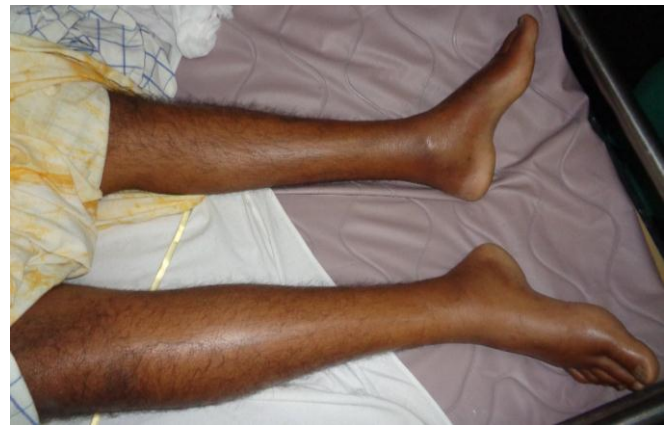
Figure 4. Deep vein thrombosis of right leg on day 9 of snakebite

The life-threatening complications due to VICC caused