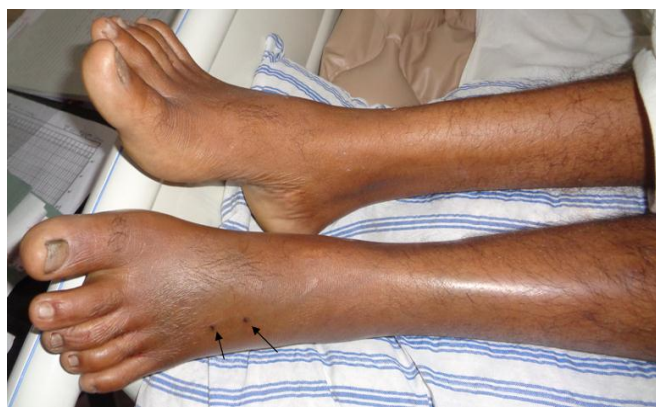
Figure 1. Site of bite (left foot) on day 2 of snakebite (indicated by arrows)

He was kept on synchronized intermittent mandatory ventilation (SIMV) mode with sedation and paralysis for 48 hrs. On day 2, another 10 vials of antivenom were administered due to persistent incoagulable blood associated with blood stained endotracheal tube secretions. On day 2, patient developed ischemic changes on his ECG (T wave inversions on V 1 -V 5 ) and the 2D-echocardiogram showed 45% ejection fraction with global hypokinesia. He also had oliguria associated with elevated blood urea and creatinine levels (Figure 2) for which furosemide 5 mg/hour IV infusion was started. WBCT20 was negative from day 3 onwards. Patient was extubated on day 5 after getting T piece ventilation. He then developed hemoptysis. High-resolution computed tomography (HRCT) of chest was performed and confirmed pulmonary hemorrhage (Figure 3). On day 9, patient had severe pain in his right leg. A venous duplex study was done