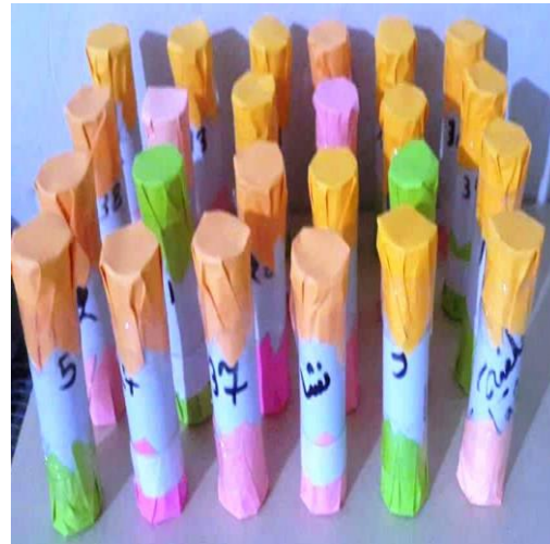
Figure 1. Sealed can technique.