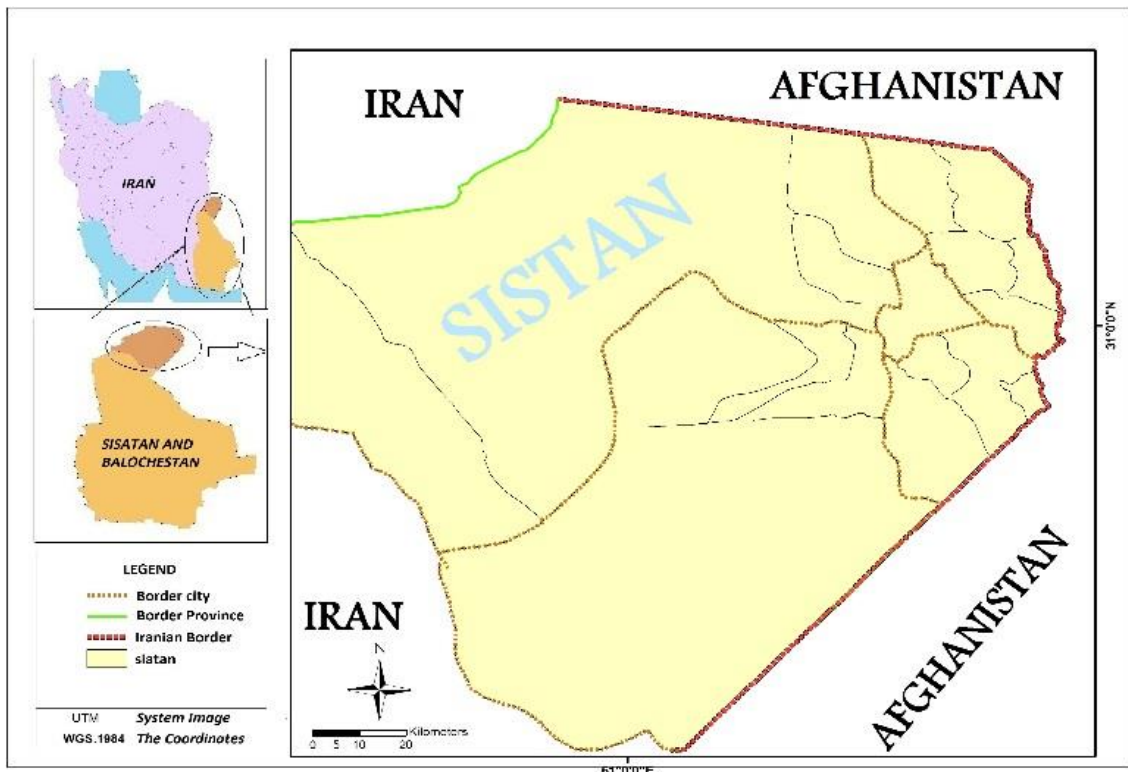
Figure 1. Introducing the area under study.