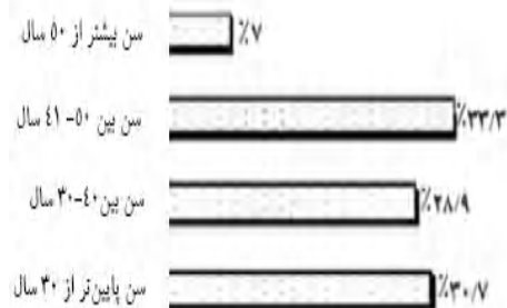
۱- توزیع فراوانی سن کارشناسان