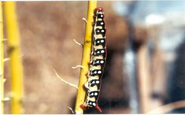
Hyles ( ) euphorbiae