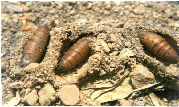
( ) Hyles euphorbiae