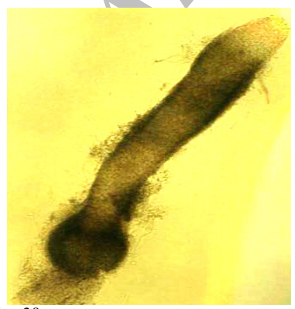
Maz-39 Magnaporthe grisea KA9 ( x ) Mat1-2