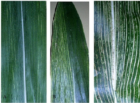
Fig. 1. MIMV symptom types: A, fine chlorotic stripes with mild intensity; B, fine chlorotic stripes with severe intensity; C, thick chlorotic stripes with severe intensity.

selection pressures acting on the gene. Analyses were performed in Datamonkey Adaptive Evolution Server ( http://www.datamonkey.org ). To detect the positive selection, single-likelihood ancestor counting (SLAC), fixed-effects likelihood (FEL) and random-effects likelihood (REL) methods were used with GTR model and a statistical significance threshold of 0.05 or Bayes factor 50.