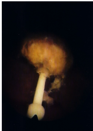
Fig 2- Endoscopic appearance bladder stone around IUD. An arm of the IUD was seen.