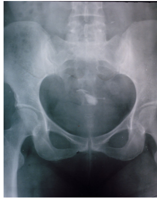
Fig 1- Plain film of the pelvis showing the encrusted IUD