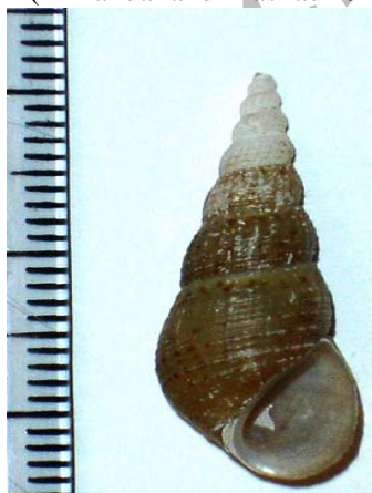
M. doriae ( Annandale 1918)