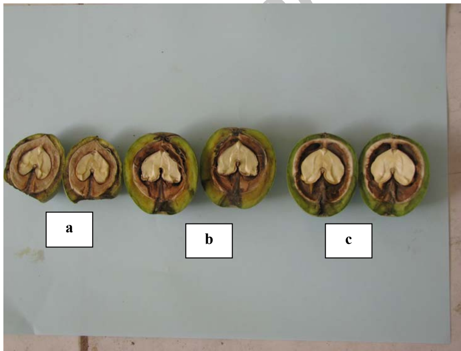
Fig. 3. Colors of packing tissues around kernel halves of Persian walnut, a. White (immature), b. Just turned brown (mature), c. Dark brown (past optimum maturity).