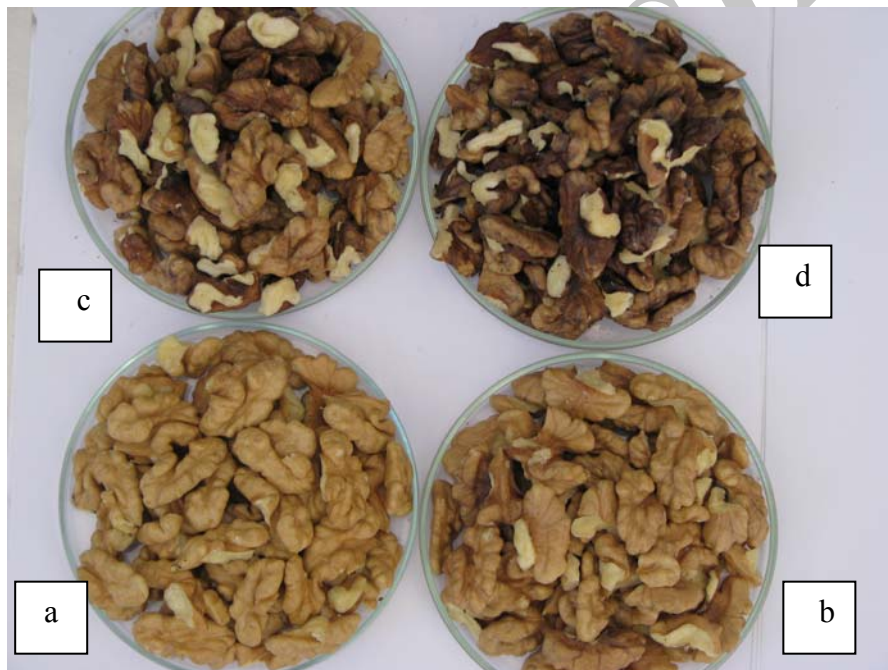
Fig. 1. Persian walnut kernel color at different harvesting dates, a. 5 th August, b. 12 th August, c. 19 th August, d. 26 th August.