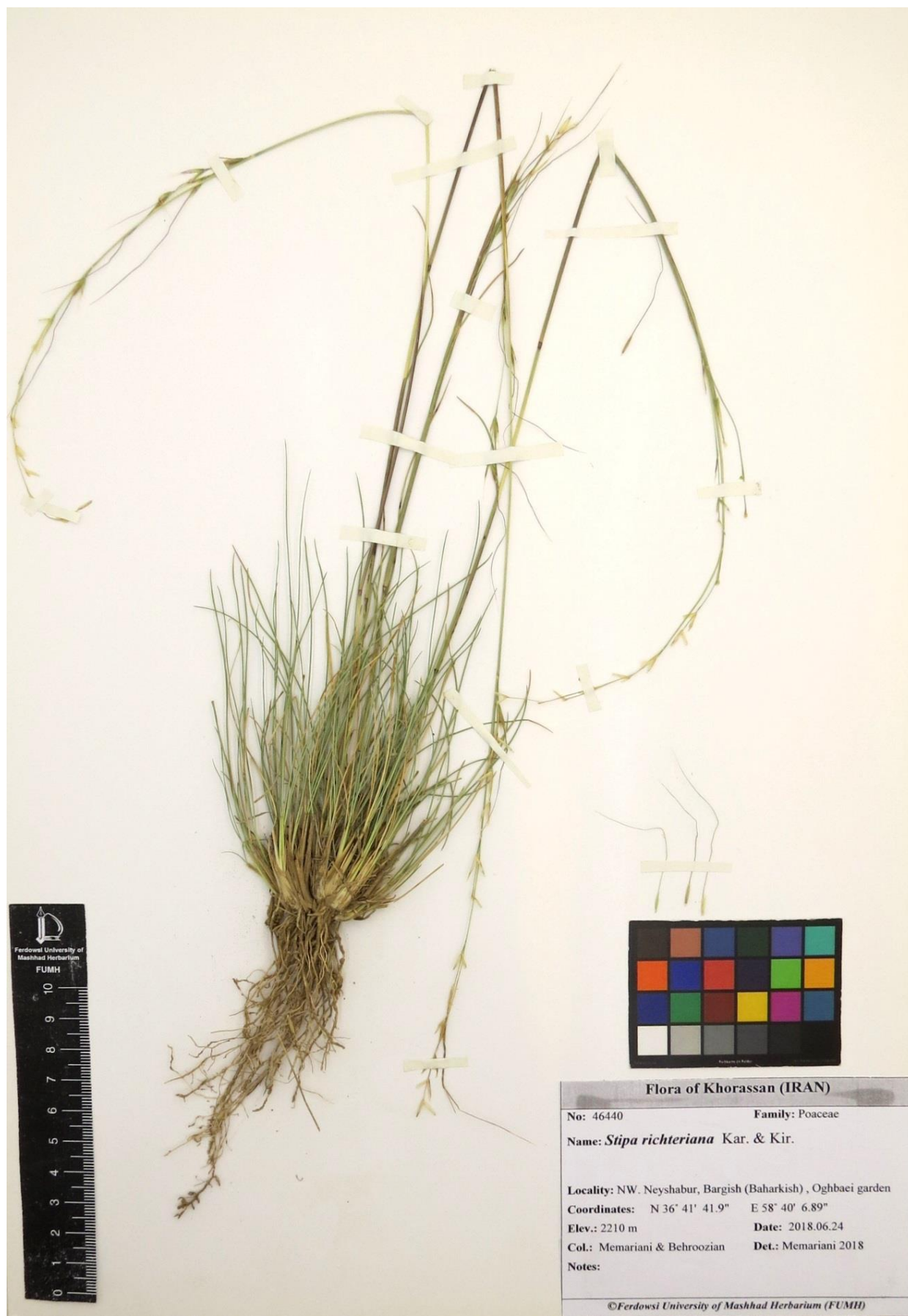
Fig. 1. Herbarium specimen of Stipa richteriana (Memariani & Behroozian 46440, FUMH).