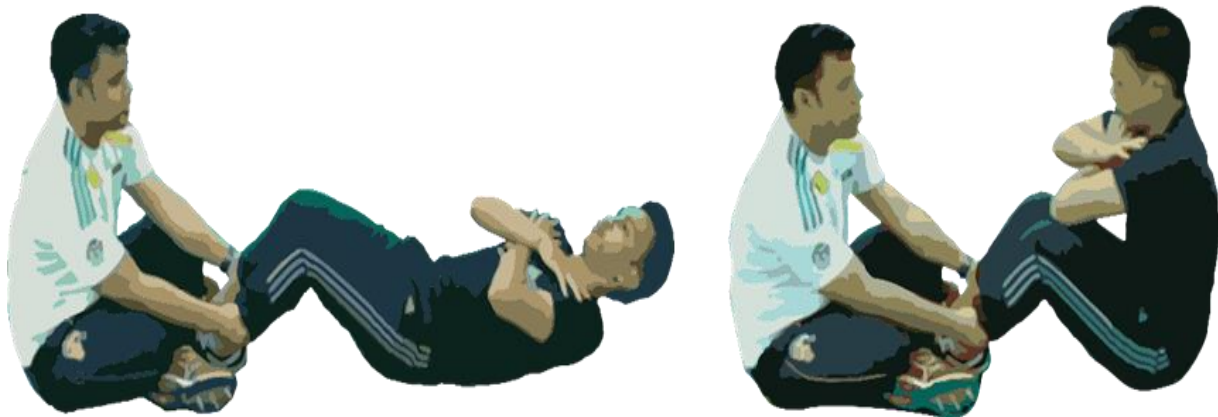
Figure-3. Illustration of one-minute of sit-up test

among participants. Prior to the test, participants performed a 15 minute standardized warm-up for physical and mental readiness. All participants were fully briefed and familiarized with the test protocol. Participants lay on their back with their knees bent at approximately right angles (90°) while both feet were positioned flat on the ground. They held their hands against and crossed their chest during the test (Figure 3). An assistant held the subjects' feet placed on the ground. Participants sat up until they touched their knees to both elbows; then, they returned to the floor (19). The movement was repeated as many times as possible for 1 minute. The assistant kept the participant informed of the time remaining. The assistant counted and recorded the number of completed correct sit-ups. The test was measured only once due to fatigue influence.