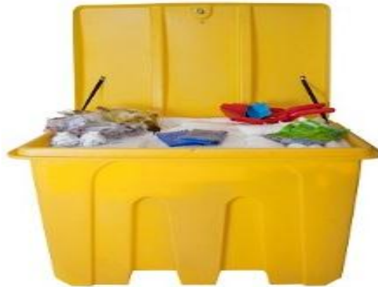
Figure 1: A large, tough and convenient plastic storage locker

It has seen on some vessels that in addition to the SOPEP locker, SOPEP equipment is being stored in portable units secured on deck. In figure, 1 shows a large, tough and convenient plastic storage locker, and figure2, shows metal type of portable SOPEP box. Storing equipment in portable device will greatly improve the response time in an emergency that is located a distance from the SOPEP store [2].