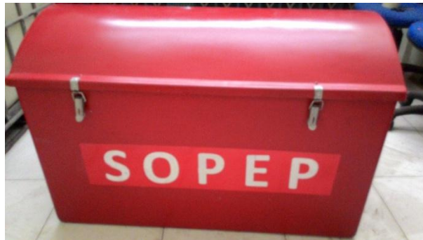
Figure 2: metal type of portable SOPEP

The primary objective of this is to stop or minimize oil outflow in the event of when either damage to the ship such as a collision, fire or explosion or from an error during routine operations spills occurs.