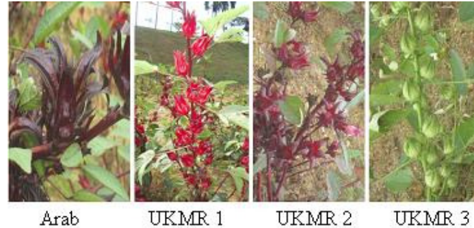
Fig 2. Calyx color differences in roselle mutants UKMR 1, UKMR 2 and UKMR 3 along with their parental variety Arab (UKMR1 is red, UKMR 2 is deep red and UKMR 3 is light green and the parent variety Arab's calyx is dark red color)