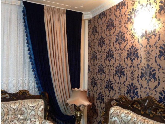
North part of home