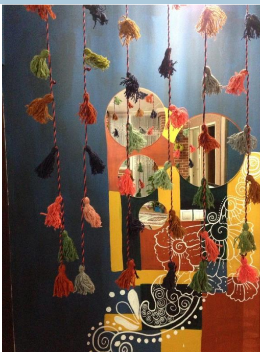
Combination of the colors we used in this project