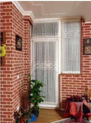
South part of home