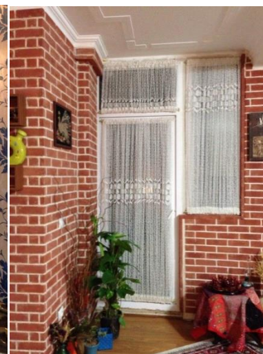
South part of home