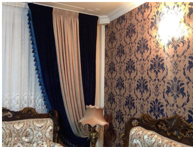
North part of home