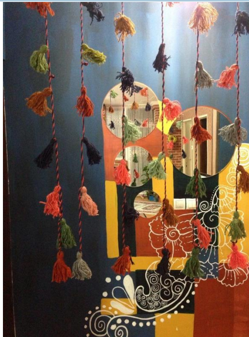
Combination of the colors we used in this project